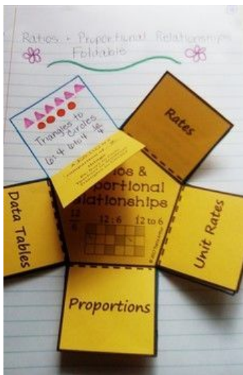
← 5 equal size squares around a pentagon.

The template should be the as large as possible on one page. Here are a few examples below: